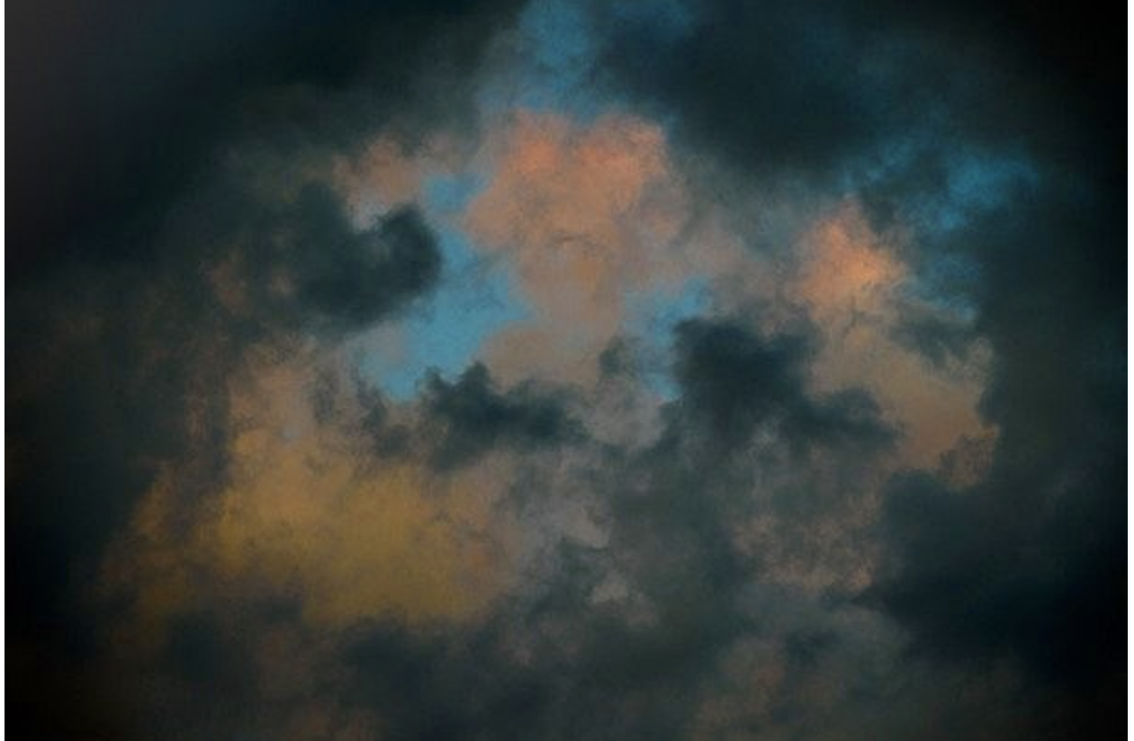
INFINITY AND BEYOND 2019 Sunset over the the Notch, Sandgate, VT 24" x 18.25" framed